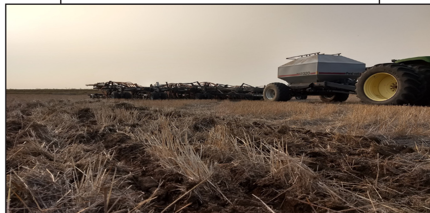
2020 planting is 50% complete near Sidney, NE